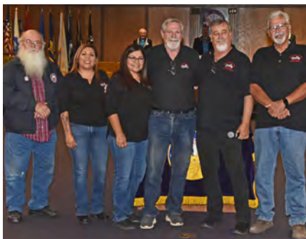
The Touring Elks present a $1,000 donation to the Alzheimers support organization