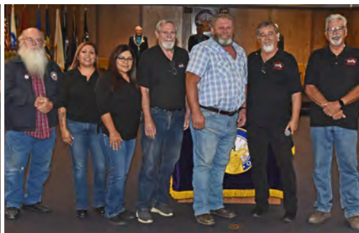
The Touring Elks present a $1,000 donation to the Veterans Committee to support the Honor Flight