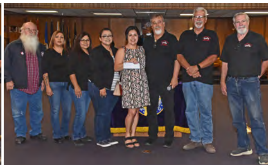
The Touring Elks present a $1,000 donation to Mission Hope to help Cancer victims